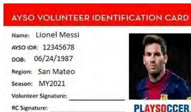
Exhibit A – Sample Player and Coach ID, and Coach Badge